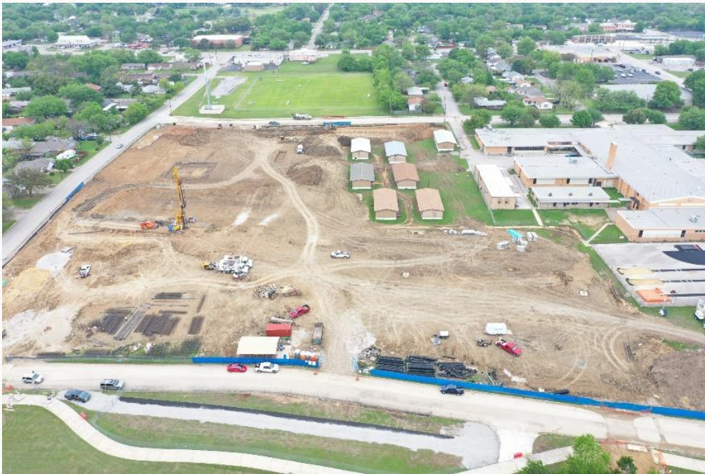
HALTOM MIDDLE SCHOOL