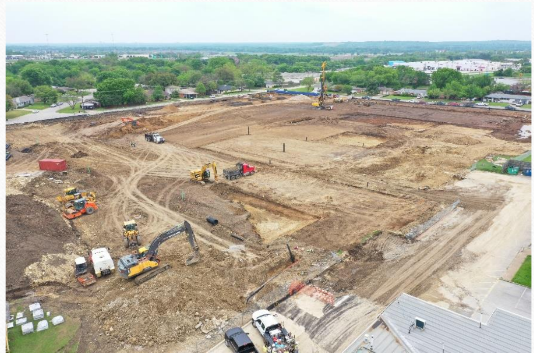
RICHLAND MIDDLE SCHOOL