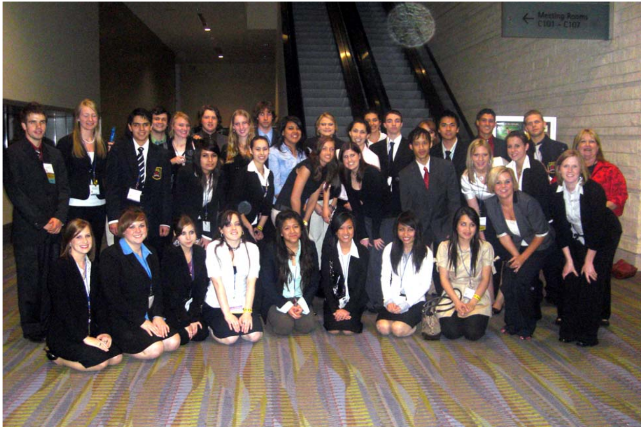
2008 BISD DECA students and teachers at the State Career Development Conference in Corpus Christi, TX March 1, 2008