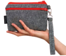
SMALL CLUTCH PURSE (Not required to be clear)