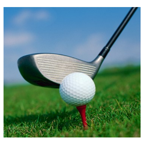
BIRDVILLE INDEPENDENT SCHOOL DISTRICT

12th Annual BISD Athletics Golf Scramble Golf Club at Fossil Creek April 27, 2020