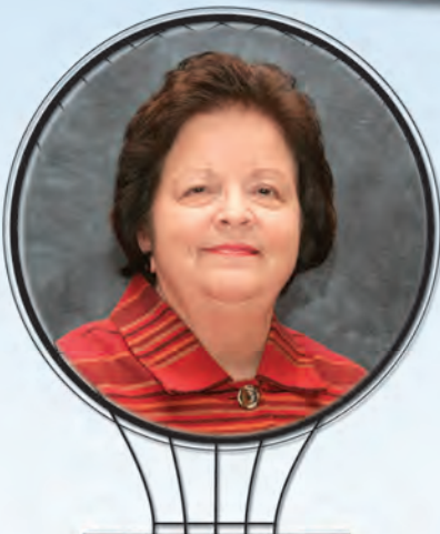
Diana Hillhouse Academy at C.F. Thomas