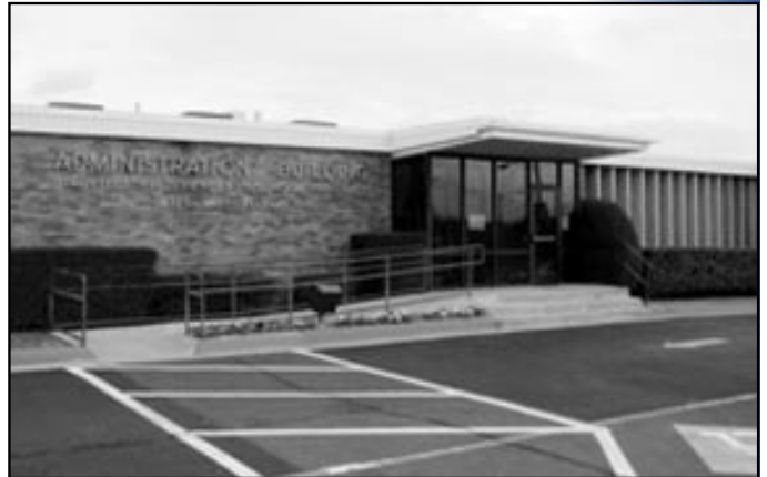
Construction on an addition to the Administration Building is scheduled to begin in spring 2002. This is the last project to be addressed under the 1996 bond.