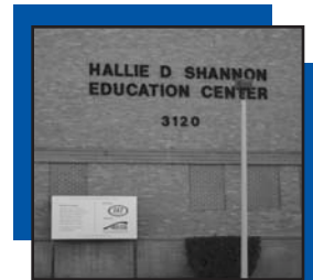
Shannon Education Center