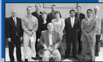
Middle school recipients