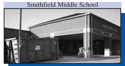
Smithfield Middle School