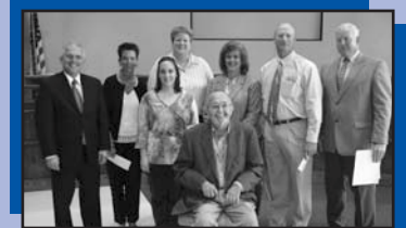
High school recipients