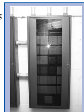
Aging fire alarm systems will be replaced.