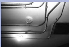
Prop II addresses miscellaneous electrical and fire alarm upgrades.

Please join me in celebrating BISD students. I look forward to seeing you at the Bass.