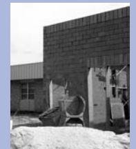
Construction on the network operating center began in February.