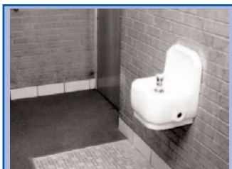
For health reasons, carpeting will be replaced with vinyl flooring.

Proposition II does include money for computer and network equipment replacement and upgrades on each campus and additional cabling at selected campuses. (The computers will be purchased with short-term bonds.) (See Bond, page 2)