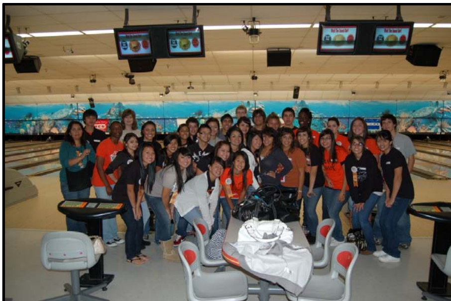
Haltom High School Health Occupations of America Members