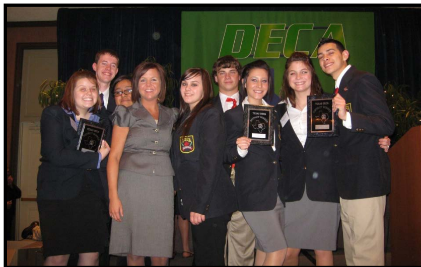
2010 Birdville High School DECA students and advisors at the District Competition in Dallas, Texas.