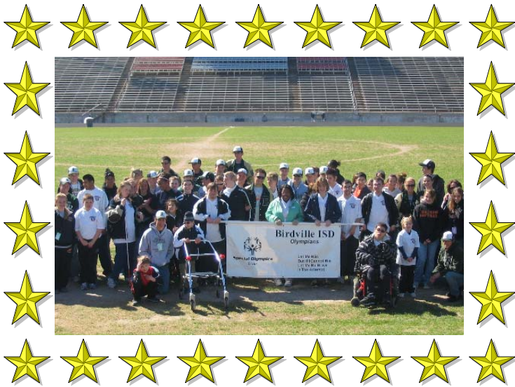
Special Olympics event was assisted by Haltom High School Softball and Birdville High School Baseball teams.