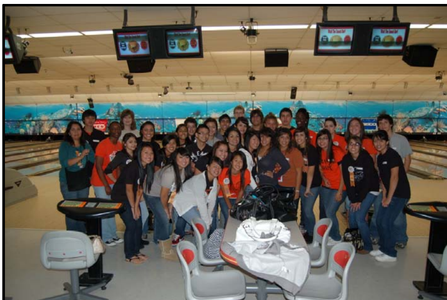
Haltom High School Health Occupations of America Members