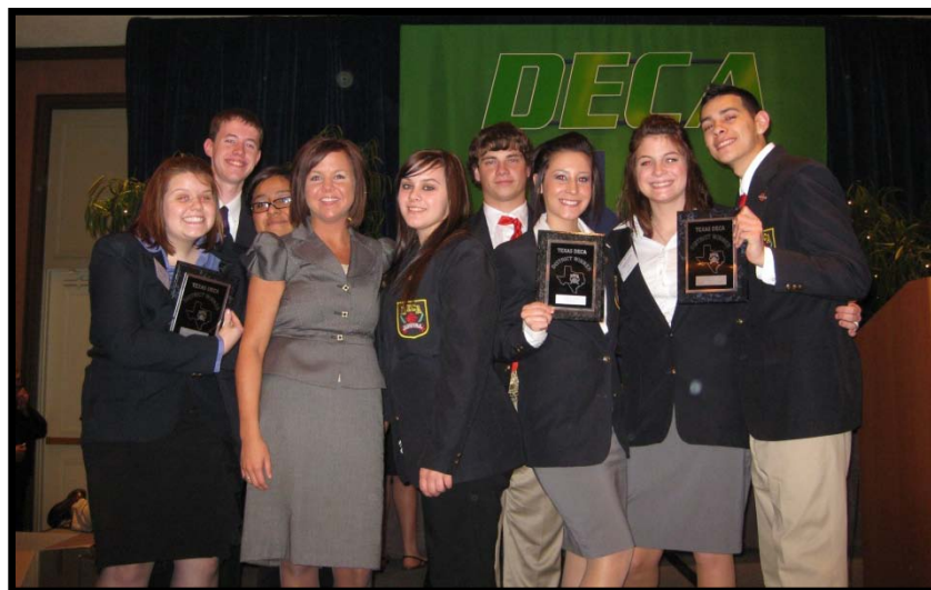
2010 Birdville High School DECA students and advisors at the District Competition in Dallas, Texas.